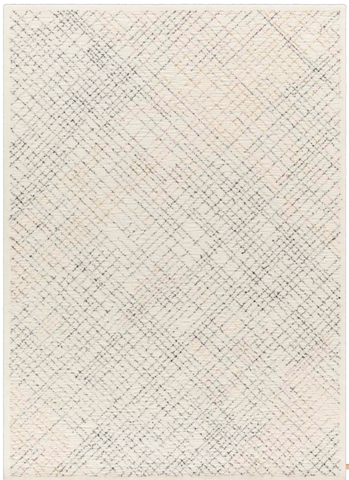
Rug 200x300 cm, White Diamond 500