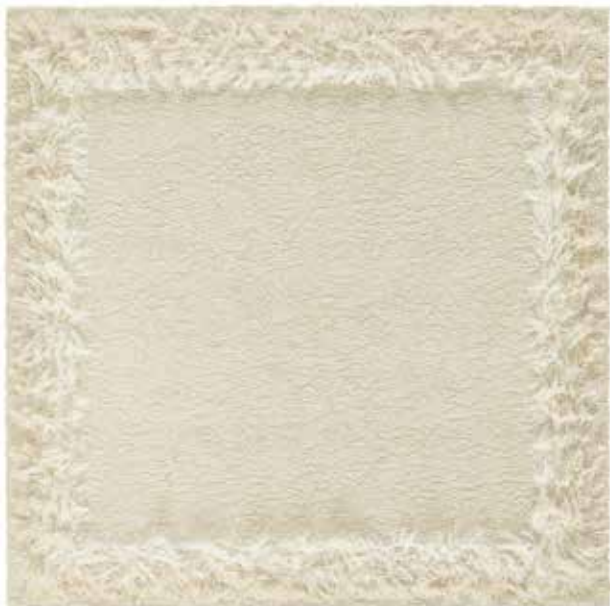
Rug 240x240 cm, Swan 801

Design ELLINOR ELIASSON Hand tufted bouclé rug in pure wool and linen