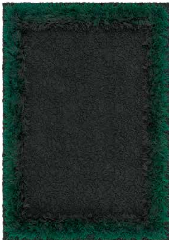
Rug 170x240 cm, Peacock 501