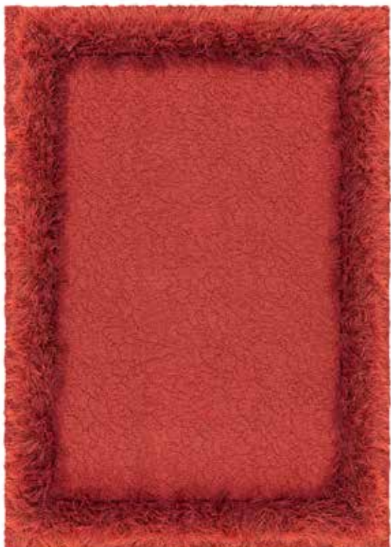
Rug 170x240 cm, Flamingo 100

Design ELLINOR ELIASSON Hand tufted bouclé rug in pure wool and linen