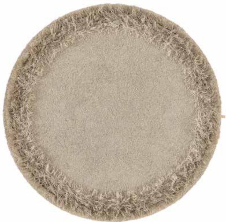
Rug round: Ø 240 cm, Heron 800