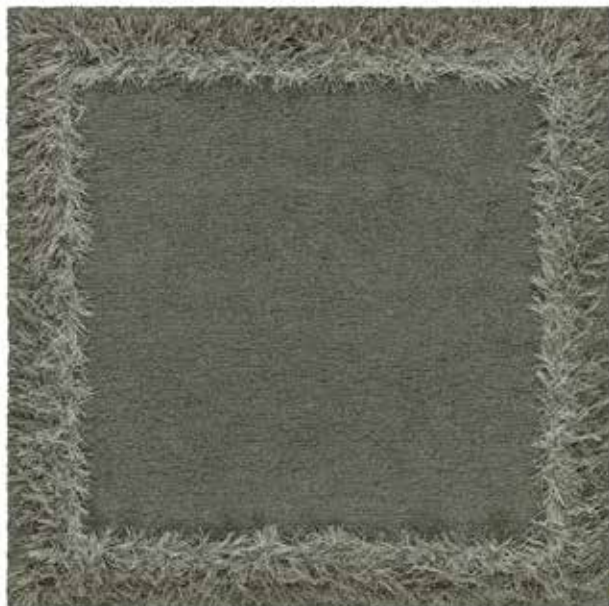
Rug 240x240 cm, Nandu 500