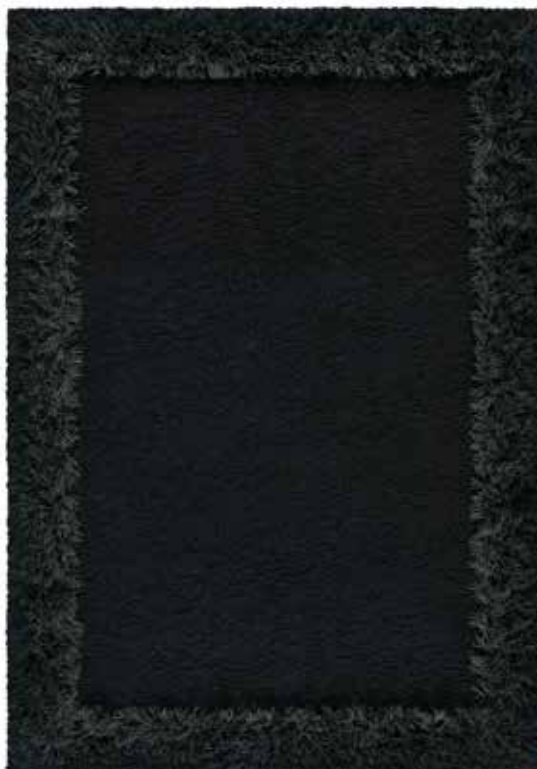
Rug 170x240 cm, Raven 502