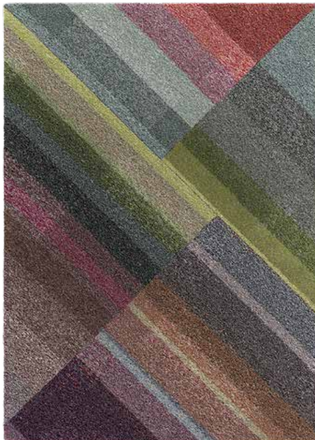
Rug 170x240 cm, Multi