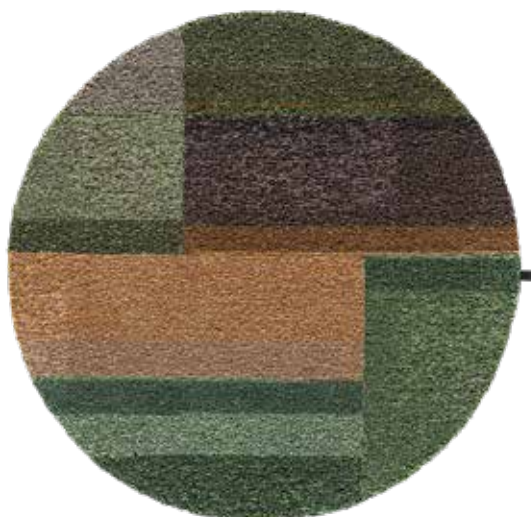
Rug 120 cm, Multi