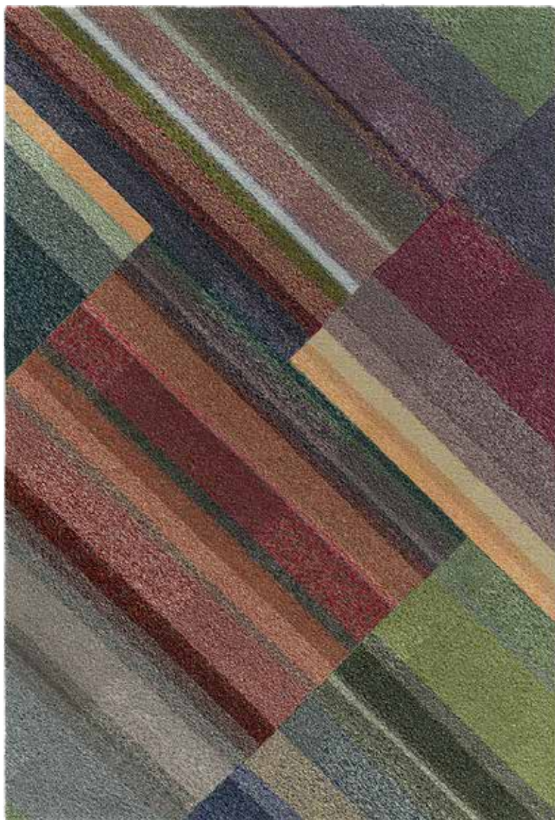
Rug 200x300 cm, Multi