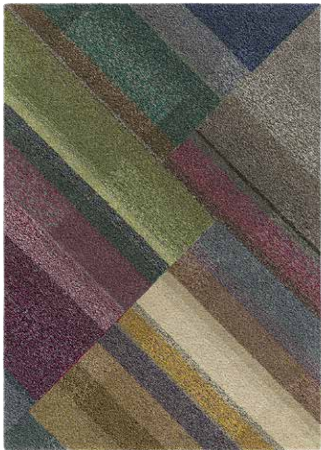
Rug 170x240 cm, Multi