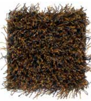
Copper Blue 820