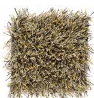
Lemon Fudge 840