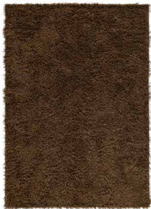
Rug 170x240 cm, Copper Blue 820