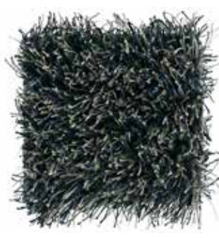
Ink Blue 521