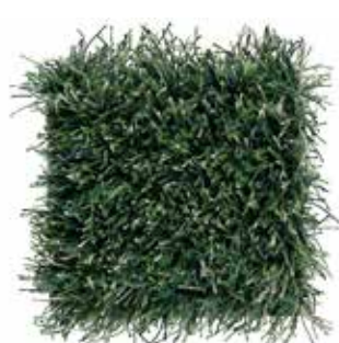
Sea Green 350