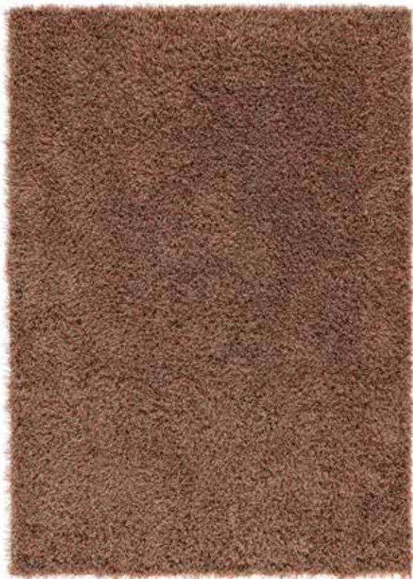
Rug 170x240 cm, Almond Blush 810