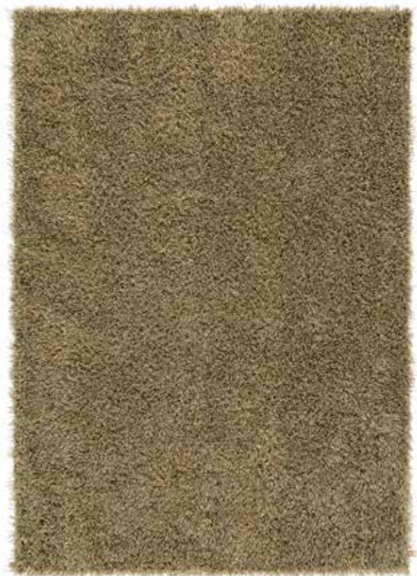
Rug 170x240 cm, Lemon Fudge 840