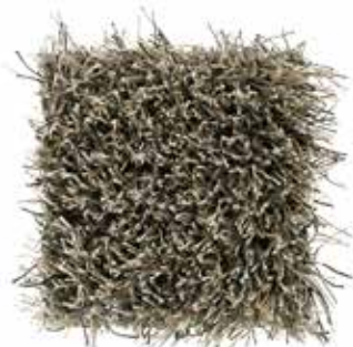
Lunar Beige 870