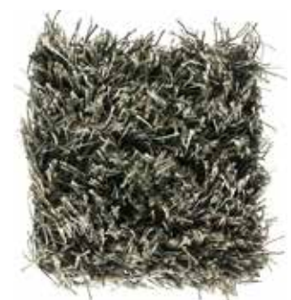
Dark Grey 1