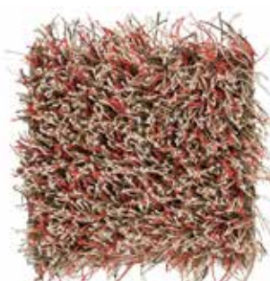
Almond Blush 810