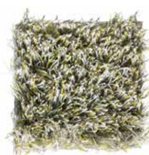
Grey Yellow 10