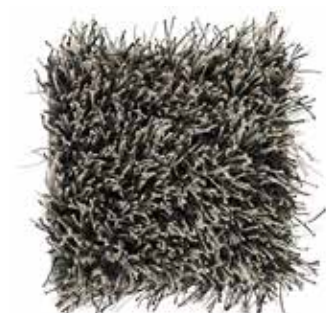
Mottled Black 580