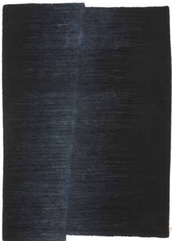
Rug 170x240 cm, Silver Dust 25

Design PETRA LUNDBLAD Hand tufted rug in pure wool and linen