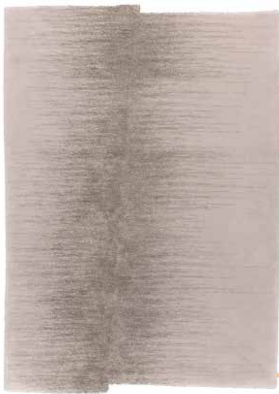
Rugs 170x240 cm, Shimmering Sand 88