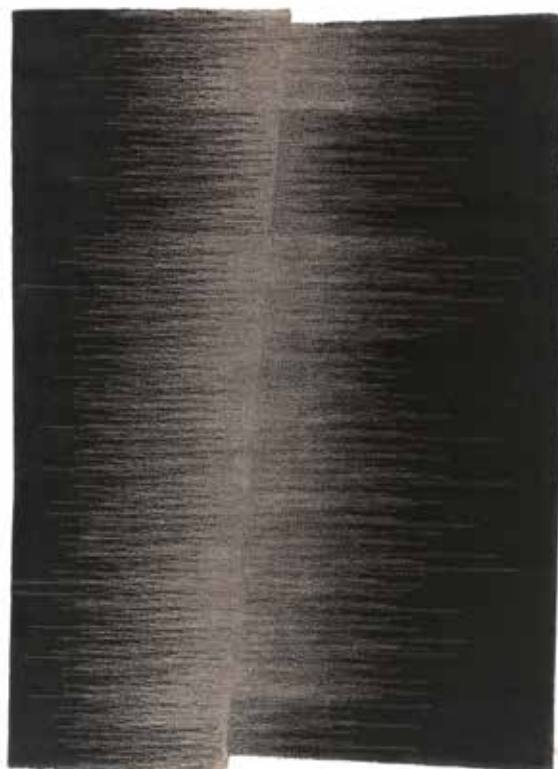
Rugs 170x240 cm, Velvet Truffle 77

Showrooms in MILAN | NEW YORK | STOCKHOLM | GOTHENBURG