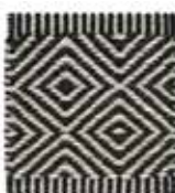
Goose Eye 909