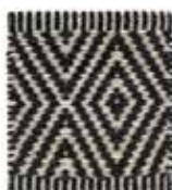
Goose Eye XL 949