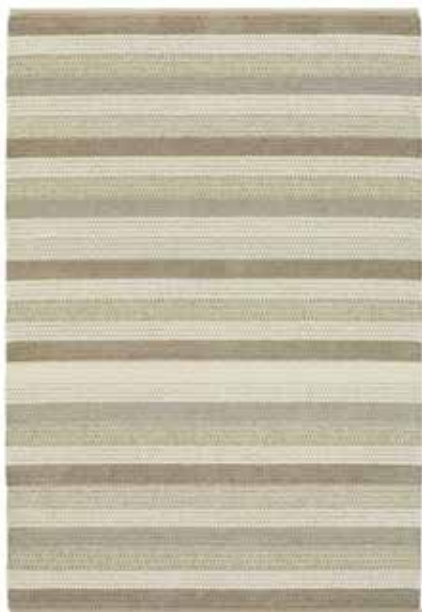
Rug 170x240 cm, Harmony 8001

Design GUNILLA LAGERHEM ULLBERG Woven chenille- and bouclé rug in pure wool and linen