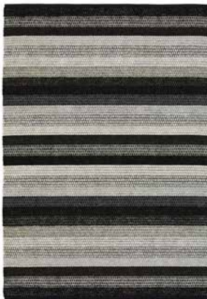
Rug 170x240 cm, Winter Night 5001