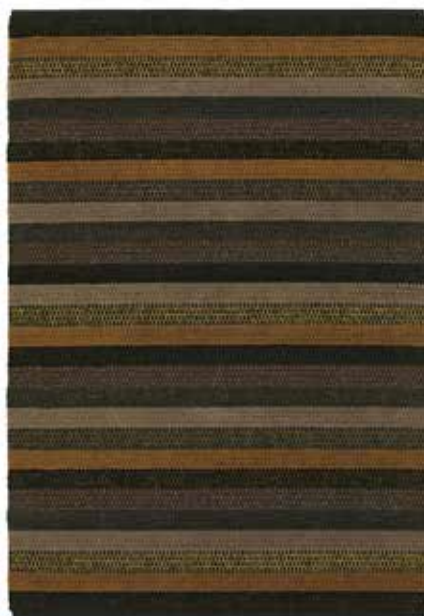
Rug 170x240 cm, Potato Digging 7001