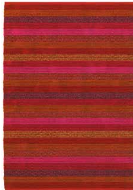
Rug 170x240 cm, Passion 1001