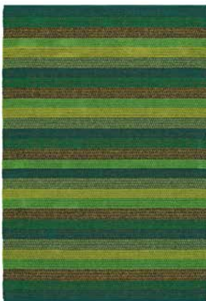
Rug 170x240 cm, Summer Holiday 3001