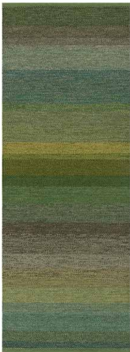
Rug 90x240 cm, Green

Design KASTHALL DESIGN STUDIO / ELLINOR ELIASSON Woven rug made of residual yarn in pure wool