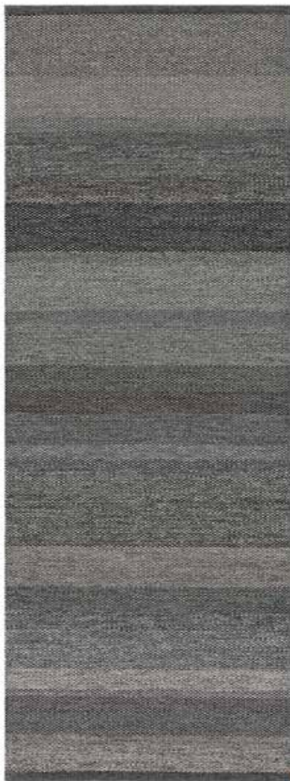
Rug 90x240 cm, Black & Grey