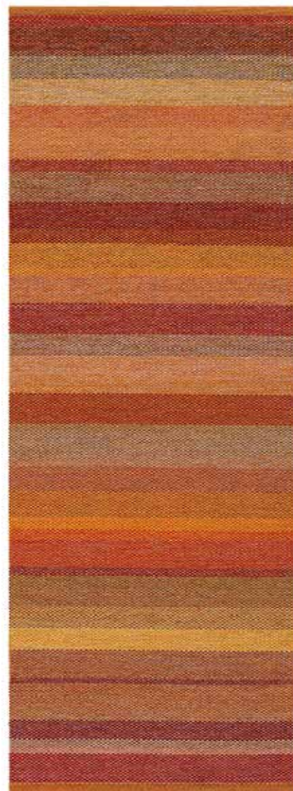
Rug 90x240 cm, Yellow & Red