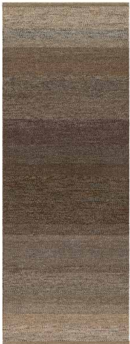
Rug 90x240 cm, Beige & Brown

Design KASTHALL DESIGN STUDIO / ELLINOR ELIASSON Woven rug made of residual yarn in pure wool