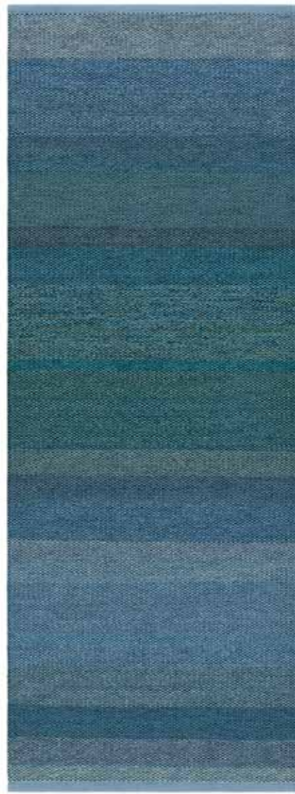
Rug 90x240 cm, Blue