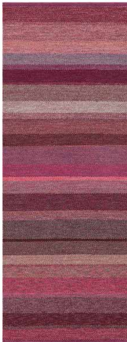
Rug 90x240 cm, Purple & Pink