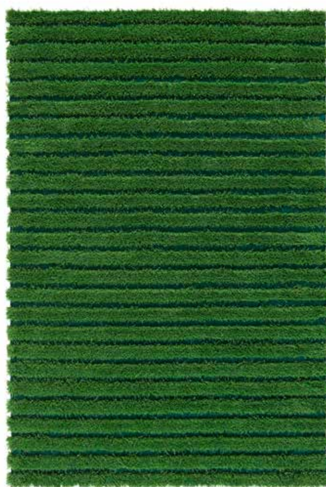
Rug 170 x 240 cm, Jungle 330