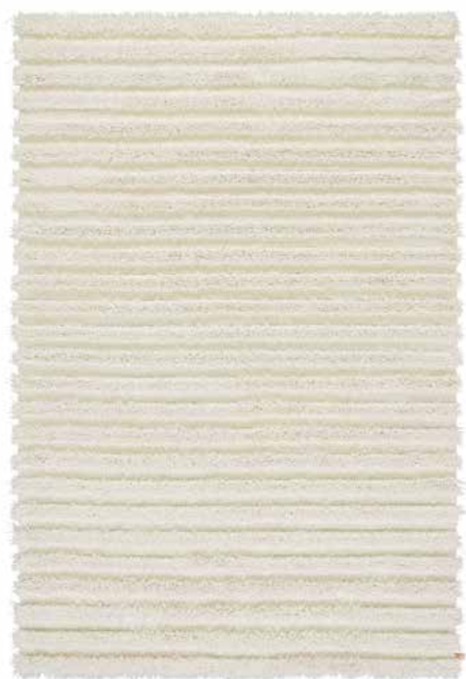
Rug 170 x 240 cm, Ghost 880