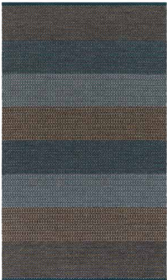
Rug 165x245 cm, Amber 801