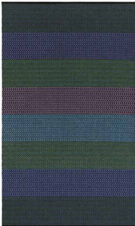
Rug 165x245 cm, Botanica 200

Showrooms in MILAN | NEW YORK | STOCKHOLM | GOTHENBURG