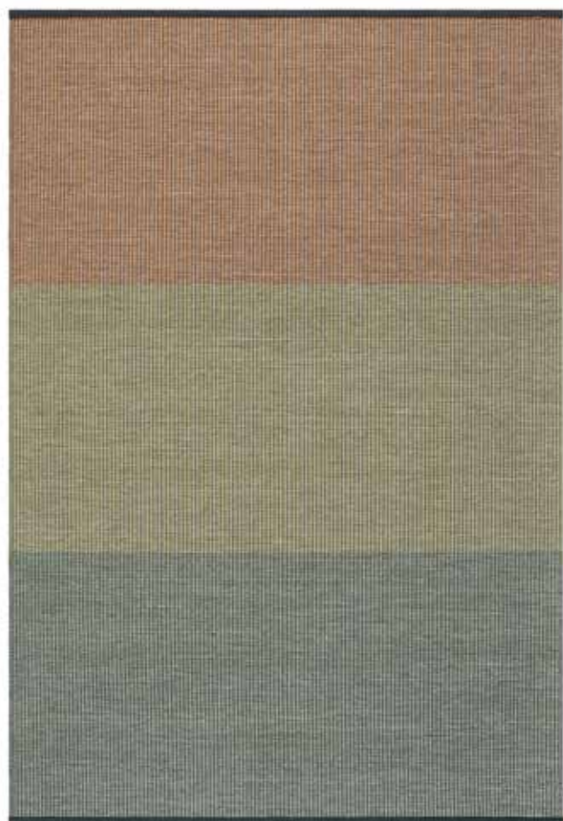
Rug 170x240 cm, Mandarin Garden 310