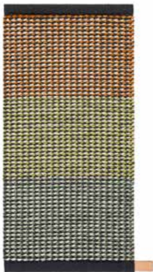
Mandarin Garden 310