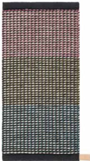
Sound of Pink 620