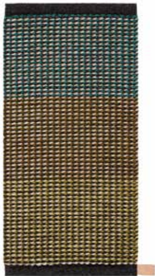
Turquoise Delight 720