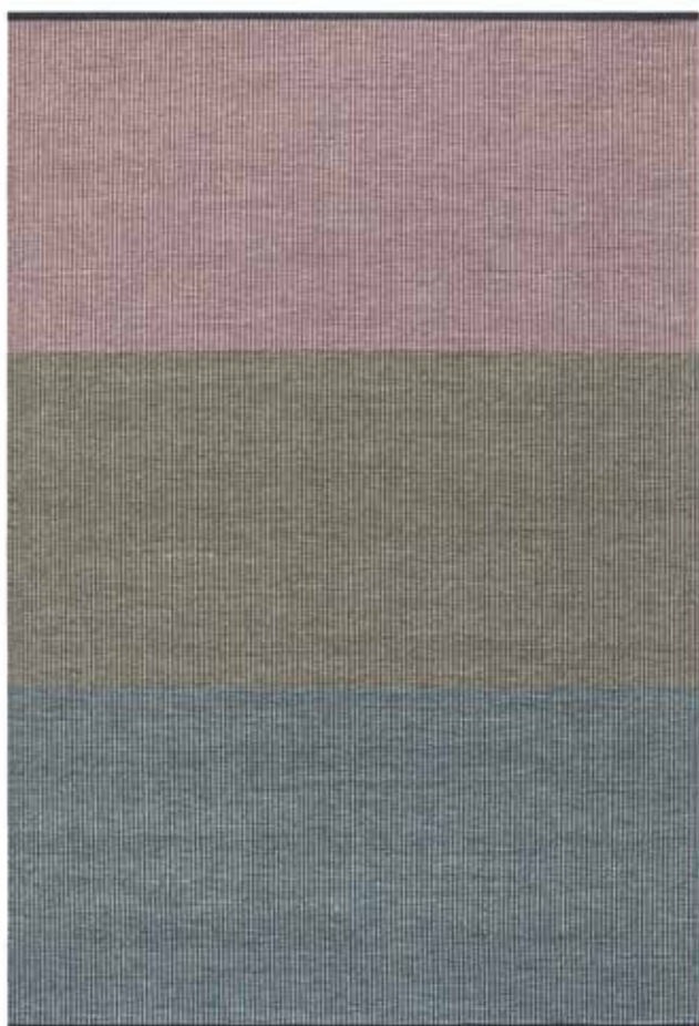
Rug 170x240 cm, Sound of Pink 620