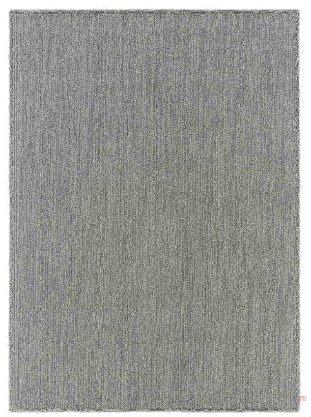
Rug 170x240 cm, Harmonic Silver 501