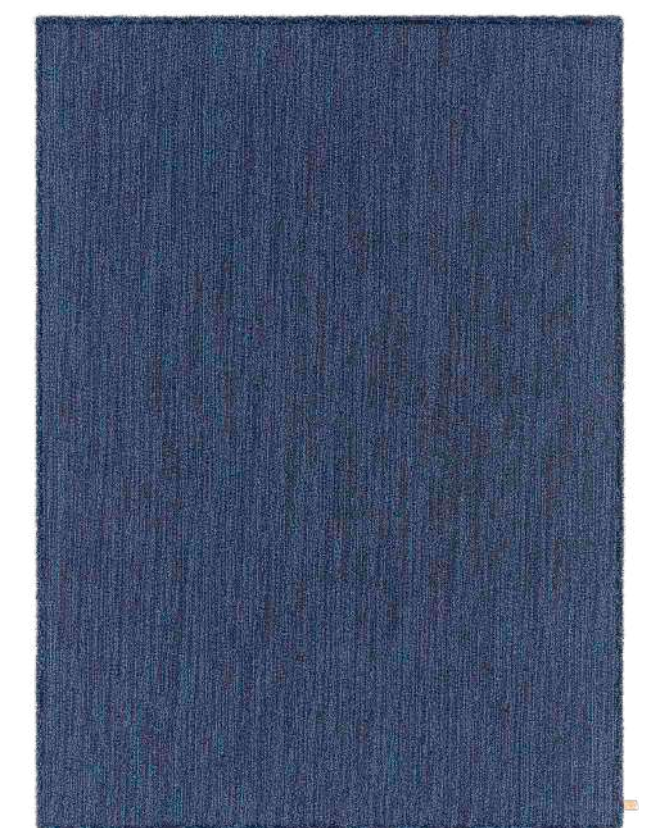
Rug 170x240 cm, Playful Purple 621