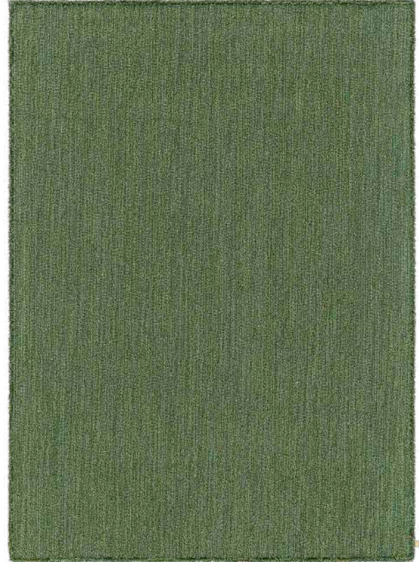
Rug 170x240 cm, Cool Green 300