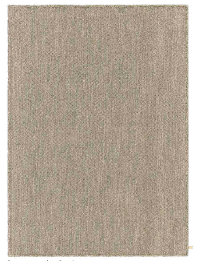
Rug 170x240 cm, Quiet Beige 800