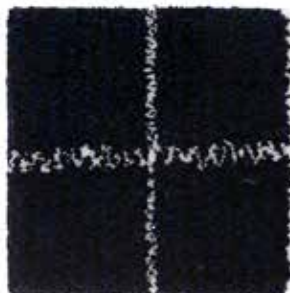
Navy Blue 200