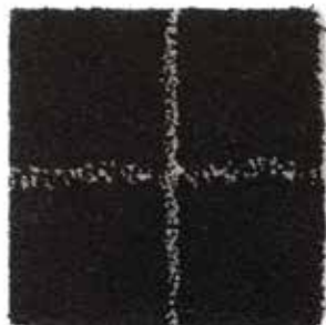
Graphite Grey 550