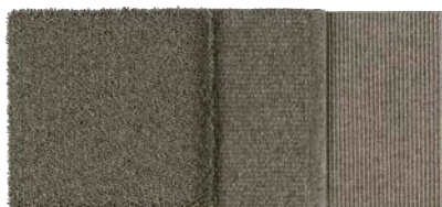
Dusty Olive 8508 / Khaki 9233