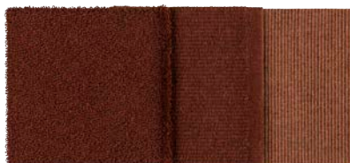
Smoked Paprika 7506 / Pale Rust 9261