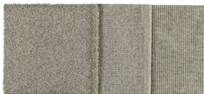
Light Natural Grey 5006 / Light Grey 9211