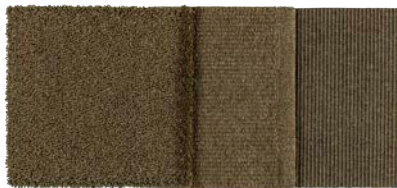
Vine Leaf 8509 / Dark Sepia 9233