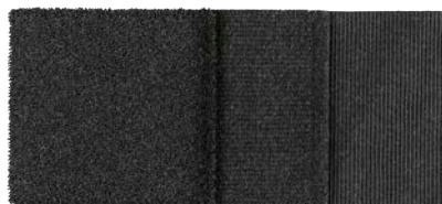
Natural Black 5007 / Natural Black 9218