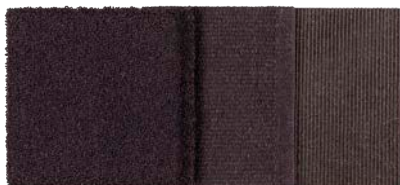
Baked Fig 6702 / Black Regal 9260