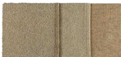
Almond Butter 8608 / Ash Blond 9232