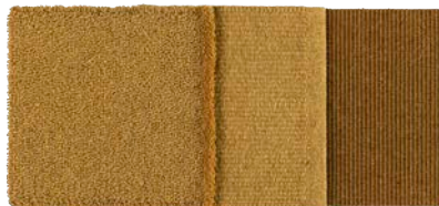
Golden Honey 4613 / Ochre 9205