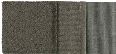
Chia Seeds 8507 / Natural Grey 9259