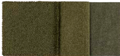
Bay Leaf 3530 / Ivy Green 9249