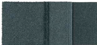
Juniper Berry 2522 / Dark Teal 9256