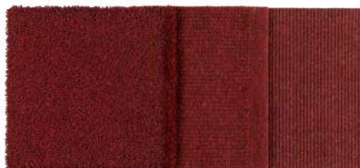
Sun Dried Tomato 1503 / Scarlet Red 9247