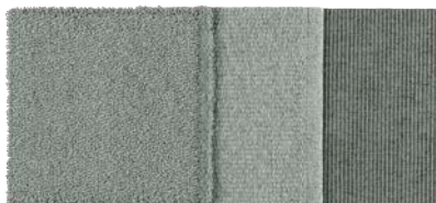
Sea Salt 2625 / Faded Grey 9257