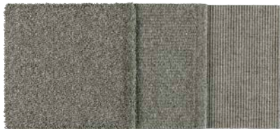
Natural Grey 5005 / Pale Grey 9251