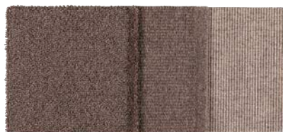
Wood Rose 6507 / Silver Rose 9255