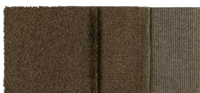
Pickled Caper 8501 / Muddy Khaki 9254