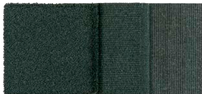
Roasted Seaweed 2513 / Darkest Petrol 9258