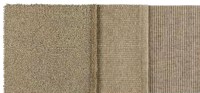
Almond Butter 8608 / Beige 9203