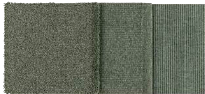
Agave Green 3511 / Salty Green 9250