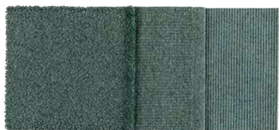
Sparkling Water 2514 / Grey Green 9235