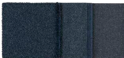
Moonlight Blue 2020 / Denim 9245