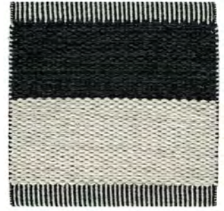
Midnight Black 554