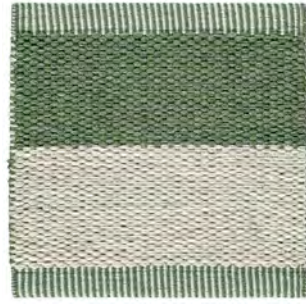
Grey Pear 350