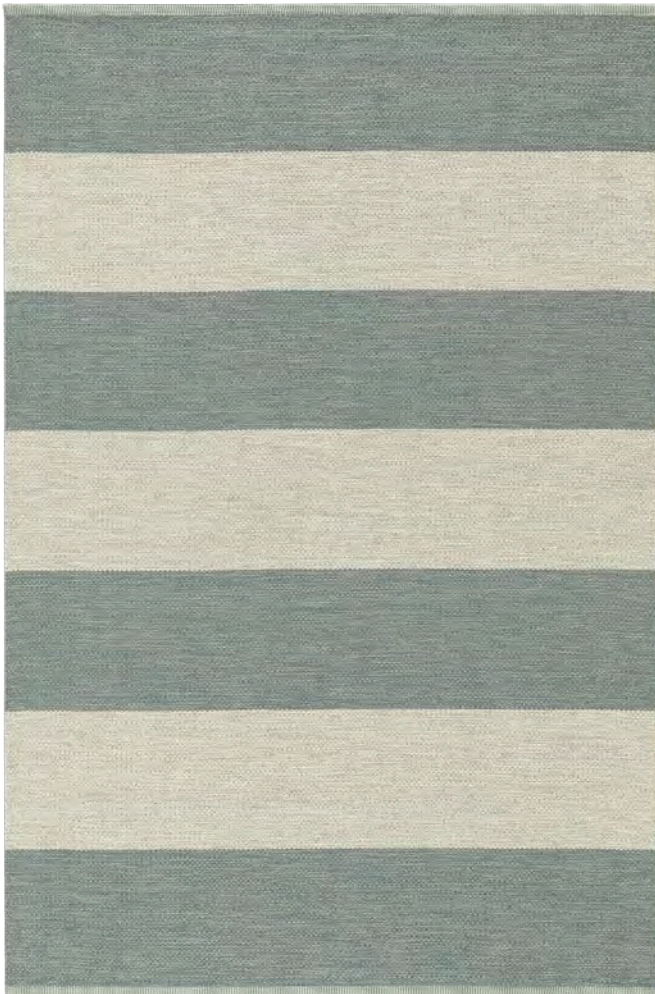
Rug 195x300 cm, Polarized Blue 251