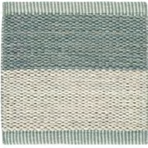
Polarized Blue 251

Design GUNILLA LAGERHEM ULLBERG/KASTHALL DESIGN STUDIO Woven rug in pure wool