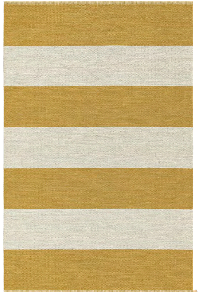
Rug 195x300 cm, Sunny Day 450